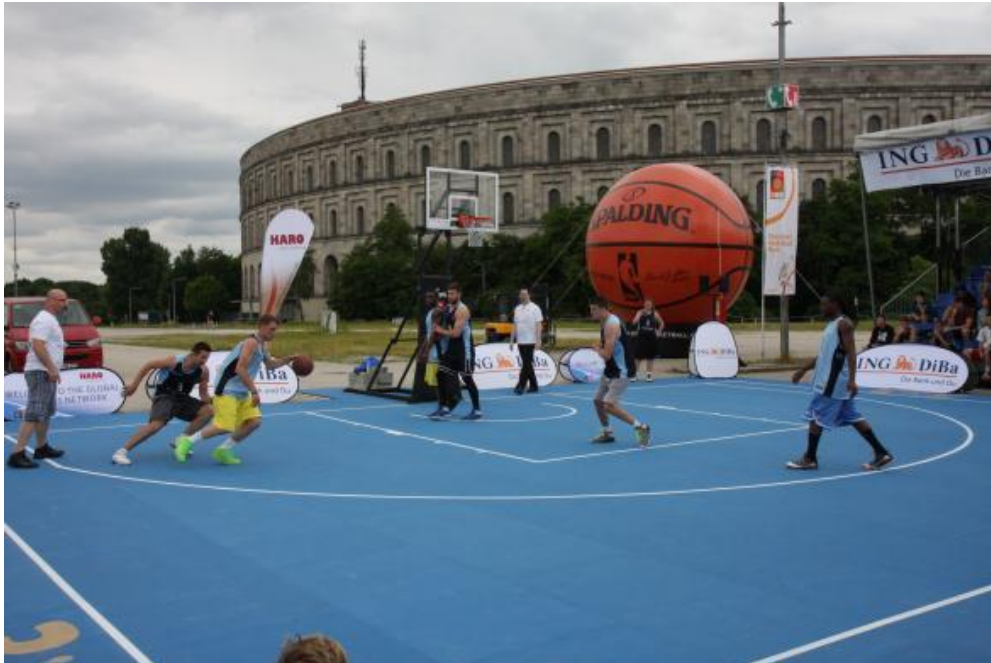
The Rome Outdoor Multi used at the DBB 3 x 3 Open 2013 in Nuremberg